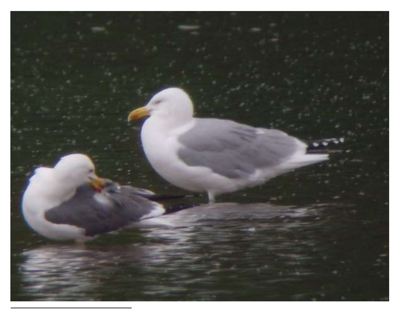
<sup>1</sup> Photographs and discussion on page 61 of the June 2000 Birdwatch

2008 – an adult at CVL from 8th May until the end of July (see article at http://www.cvlbirding.co.uk/kev/ahg.html). DNA testing proved the bird was not a smithsoniacus, although it was unable to confirm an actual identification, see http://www.pixelbirds.co.uk/Americanherringgull5.html?LMCL=rsvBoh