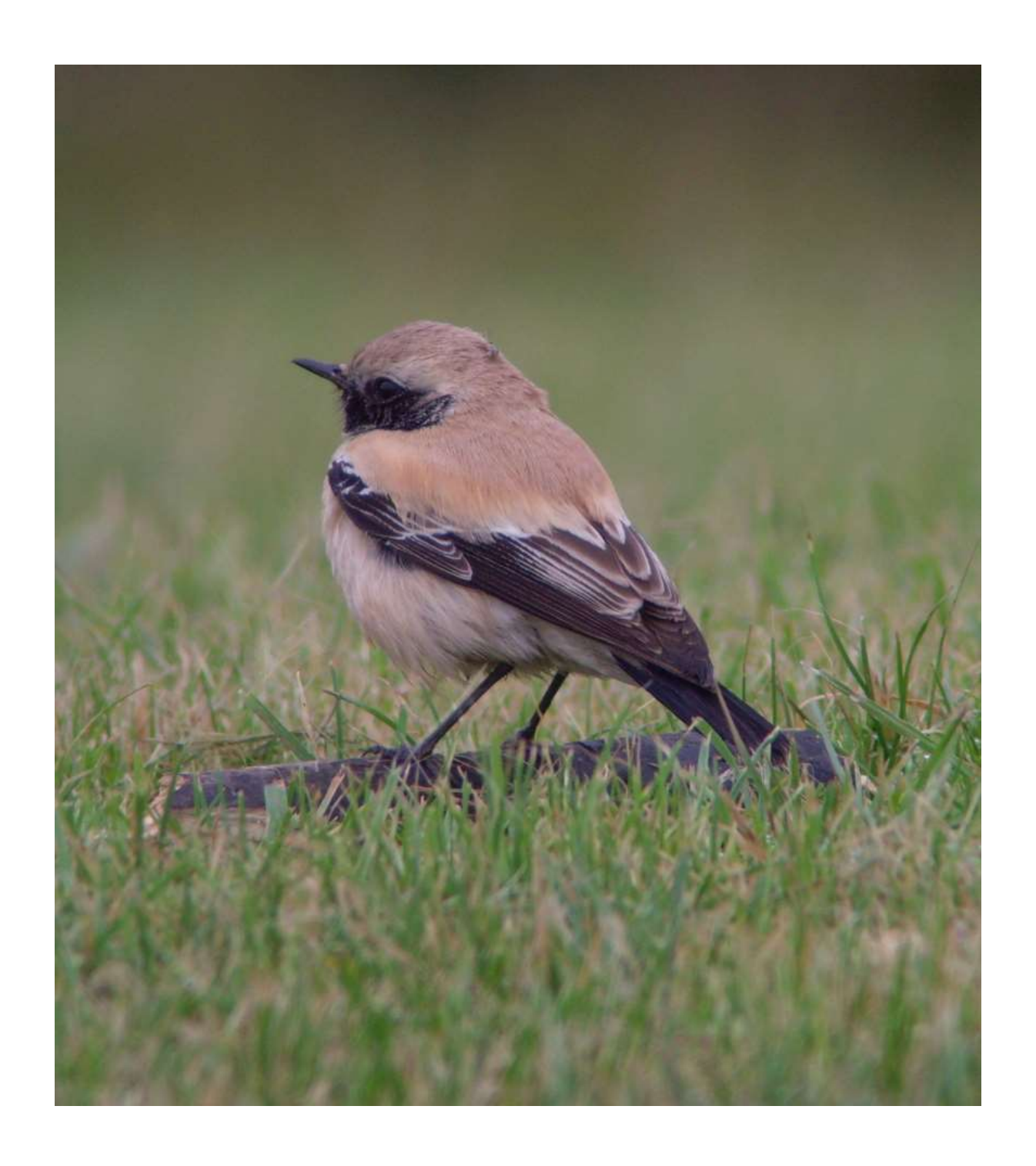
An annotated checklist