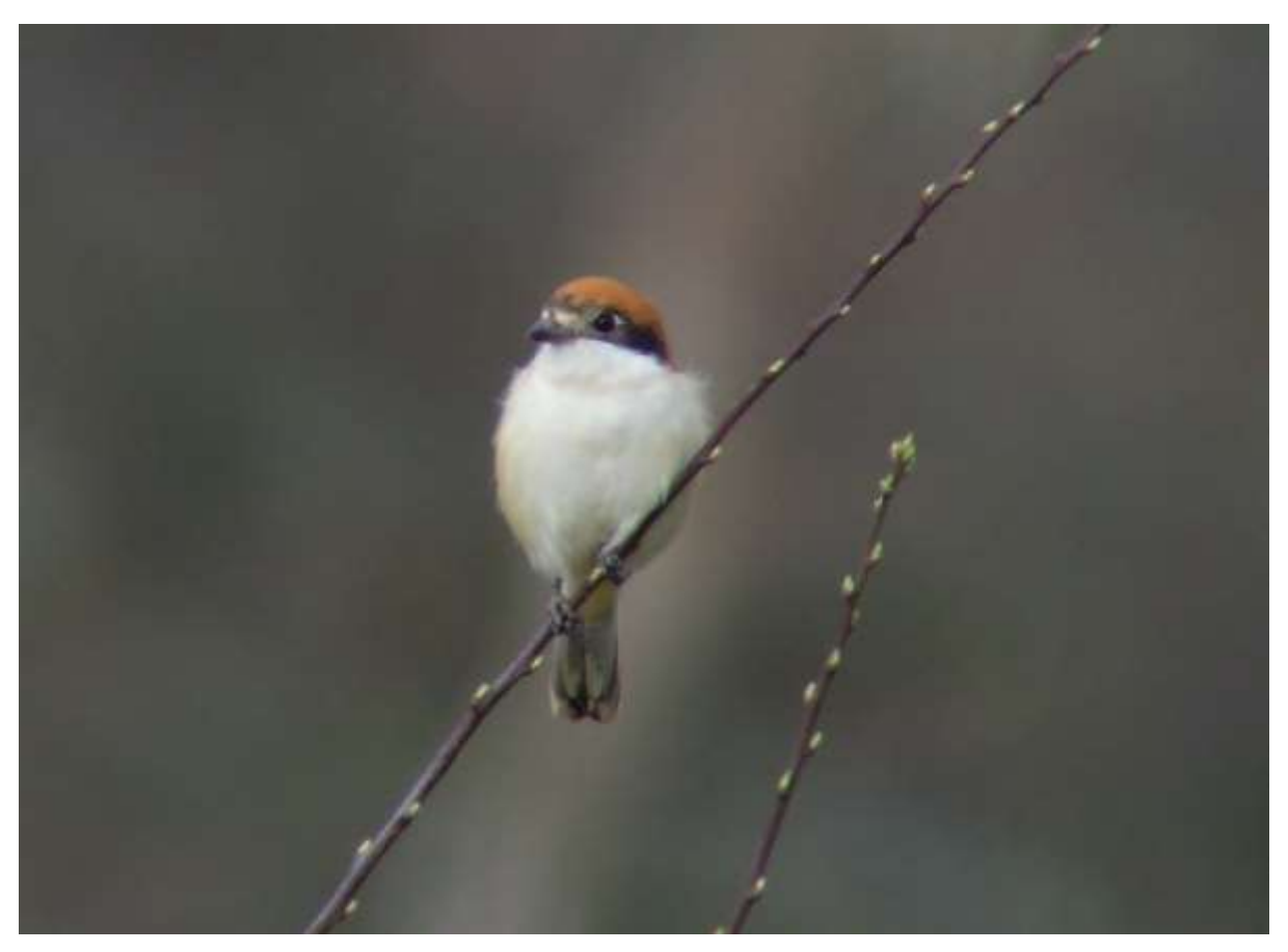
2017 – a first-winter at Chipping Sodbury Common from August 30th until September 19th [photograph]