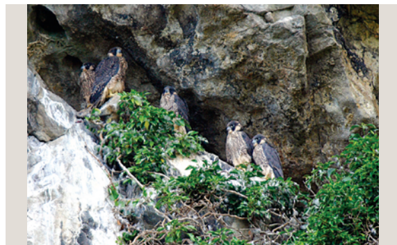
Family of five young chicks

Peregrines have been nesting here since 1990. During the past 25 years they have raised over 60 chicks, including five young in 2008, 2010 and 2011. Until relatively recently, peregrines were rare in the UK. This was mainly due to dangerous pesticides, and illegal killing by people. Protection by law, and the removal of harmful chemicals from the environment, has helped their numbers increase in recent years. Over 1,400 pairs now nest in the UK, on cliffs, and also on buildings in cities such as Bath, Cardiff and Exeter. In 1990, two of the nestlings in the Gorge were illegally killed. As a result, the Bristol Ornithological Club (BOC) set up a Peregrine Watch to protect the nest, and show visitors the birds.